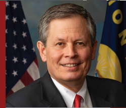
STEVE DAINES R