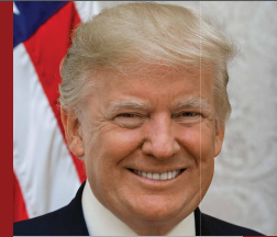
DONALD TRUMP R