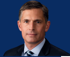
MARTIN HEINRICH D