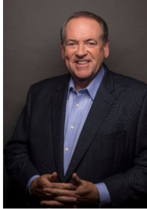
Gov. Mike Huckabee